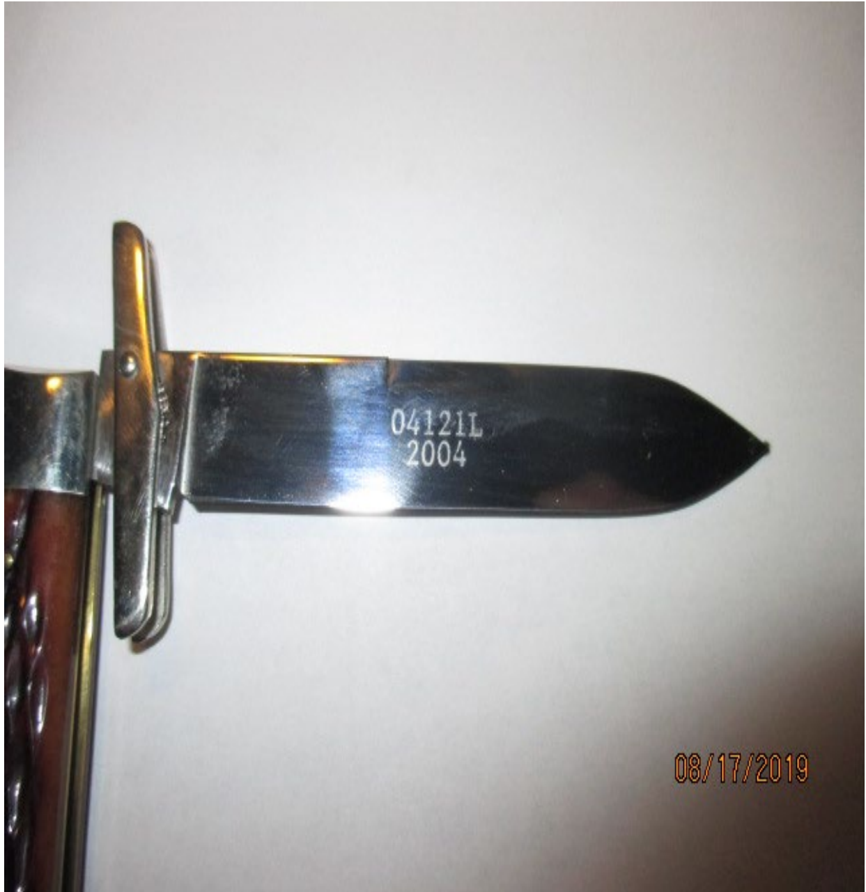
Figure 3. Pile side of 1L shown in Figure 2, showing Schatt & Morgan Model #1L, year of production on the spear blade.

The " Premier line " might be considered the nicest of Clarence's SFO lines and was begun in 2004, with two patterns each year. It was characterized by unusual knife selections, very attractive finishes, including a special "premier" Schatt & Morgan shield. He characterized the line as "The best of the best that Queen makes."