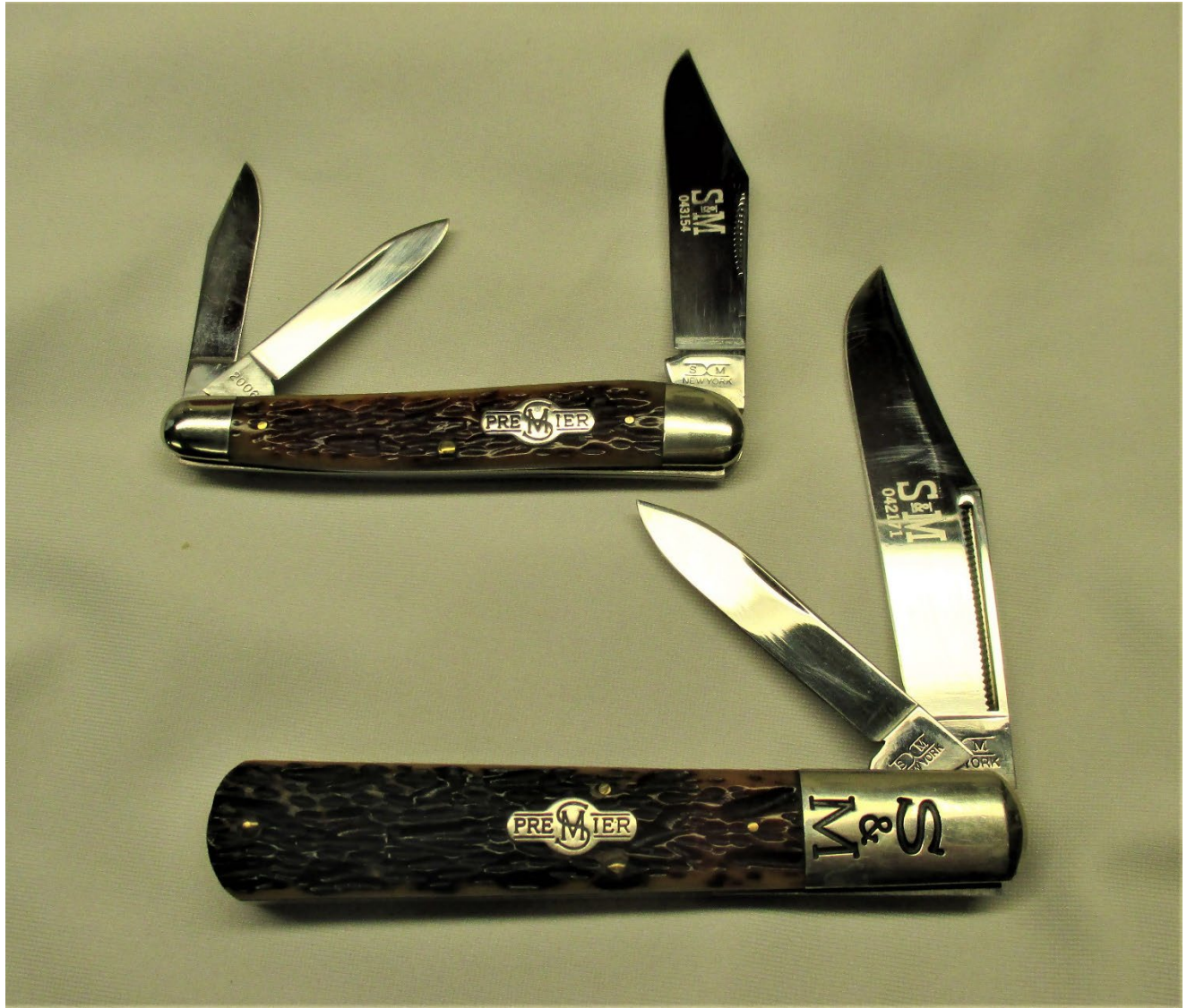
Figure 4. Samples of Premier Line, #54 whittler and #71 two-blade Daddy Barlow with Signature bolster

A reasonable estimate of Clarence Risner's special factory orders is over 250 individual knives, each usually in an edition of 100. These knives are of special interest to pattern collectors and most have lived in a drawer/safe, so often they still come with a box and are usually in great condition.