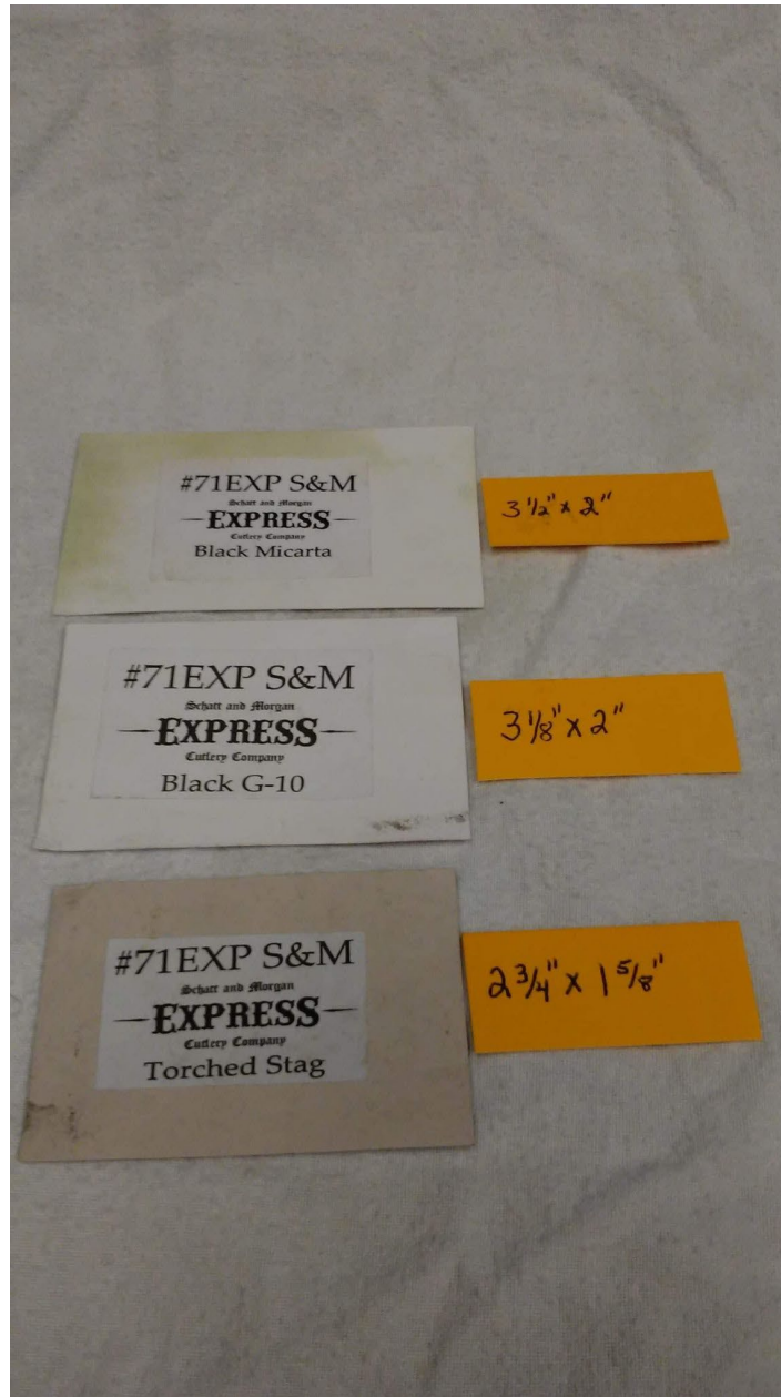
Figure 9. Insert cards used only in vinyl and nylon pouches for John Henry Express knives, showing three different sizes, small, medium, and large from front to back of image.

The package and insert materials above might help future collectors determine if a given knife is complete and factory-made.