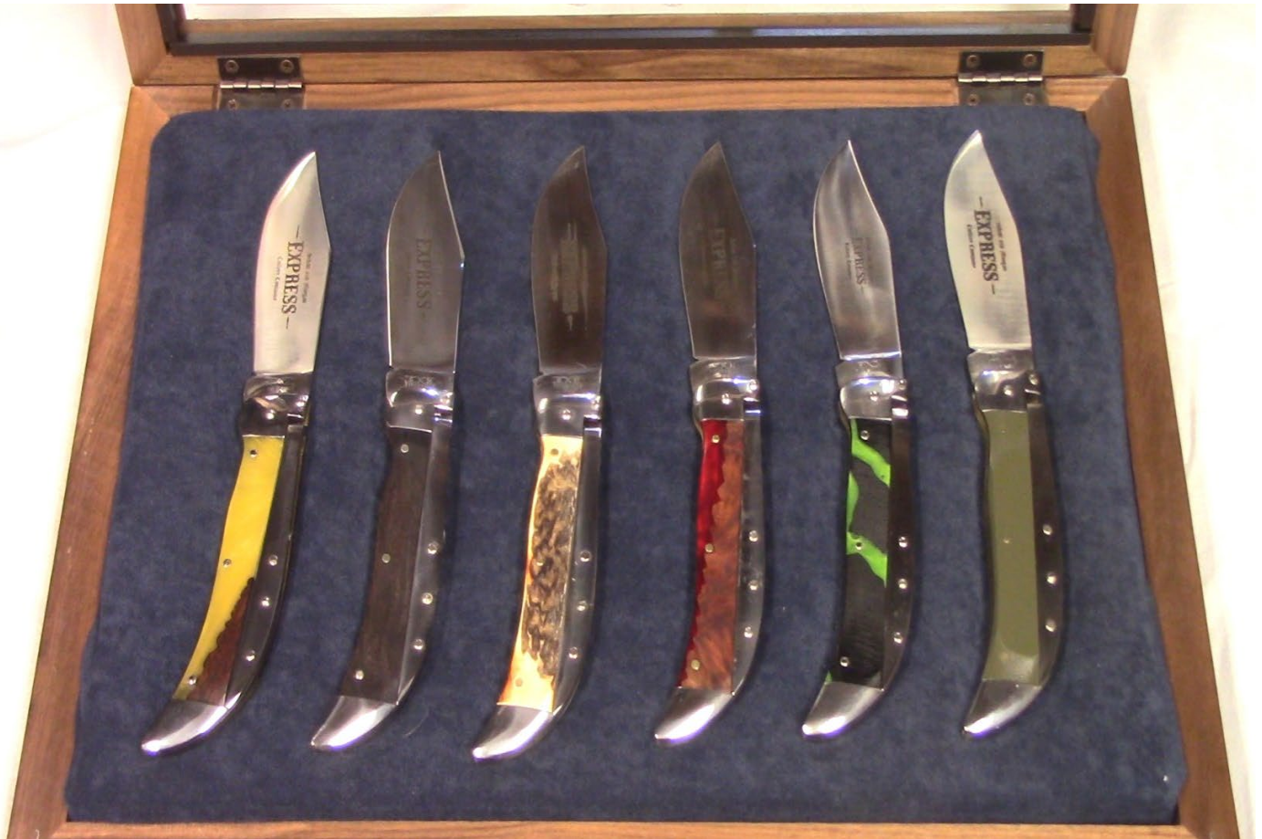
Figure 5. Numbers 13 – 18, John Henry Express Knives