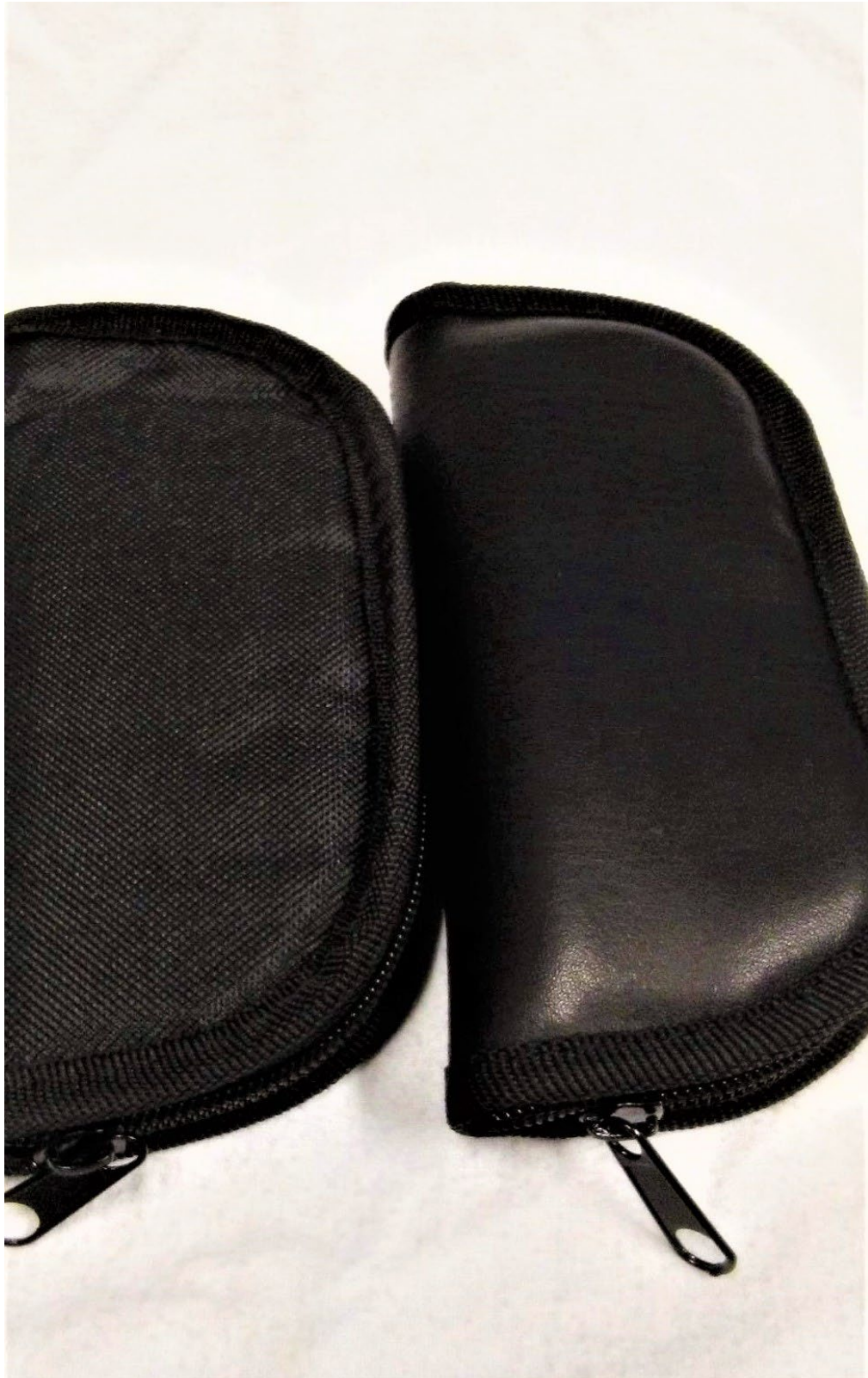
Figure 8. Nylon pouch (left) and vinyl Pouch (right) used in later editions of Express John Henry Queen Cutlery Schatt & Morgan Knives. The vinyl was used second and the nylon third for these knives.