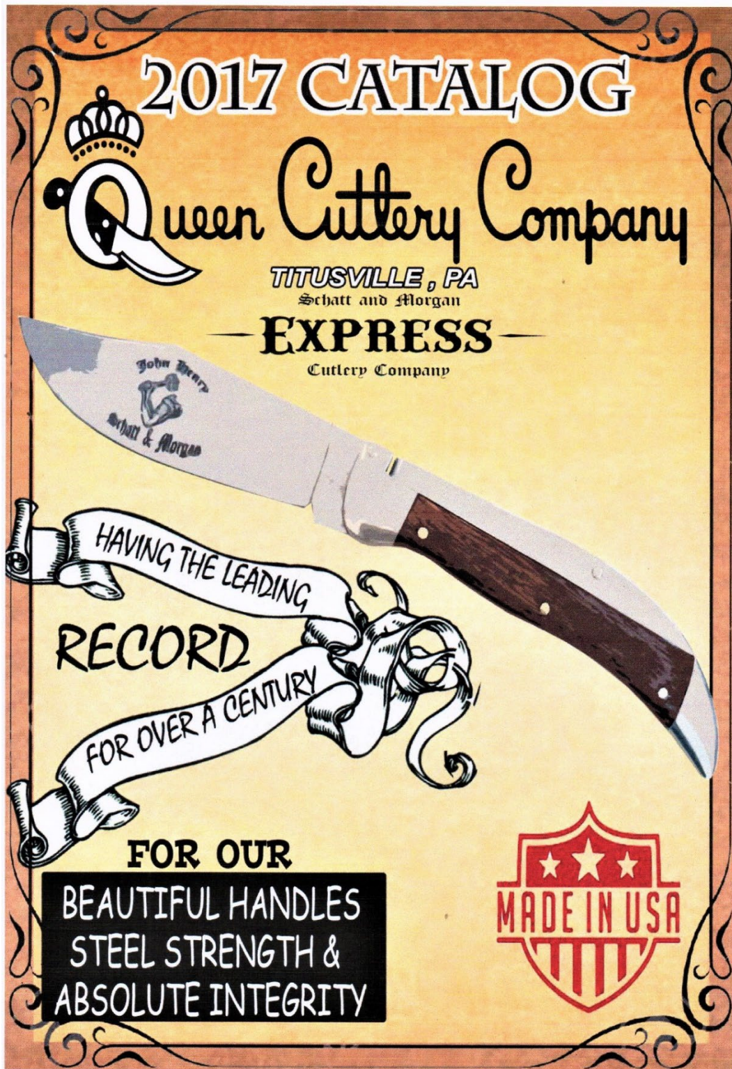
Figure 1. Cover page of last Queen Cutlery catalog, 2017, showing John Henry Express in Desert Ironwood.