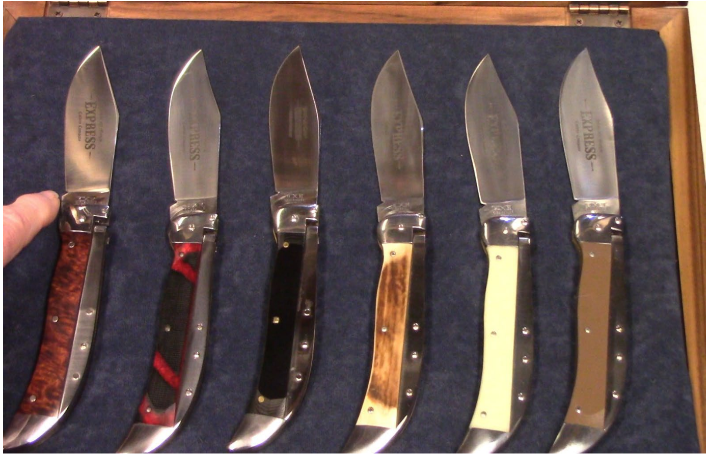
Figure 4. Numbers 7 – 12, John Henry Express Knives