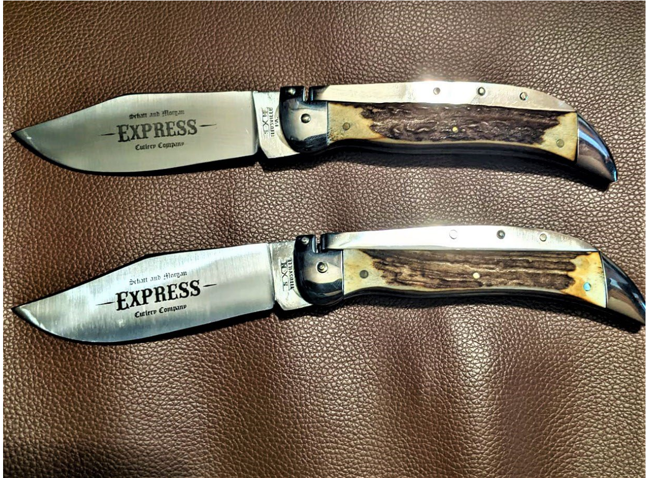
Figure 6. There are small differences in the blades used on the John Henry Express knives. These might be due to individual grinds used by the maker, or slight differences as the design of the knife was finalized. It is very clear that these differences were all made in the Titusville factory at the time of production.