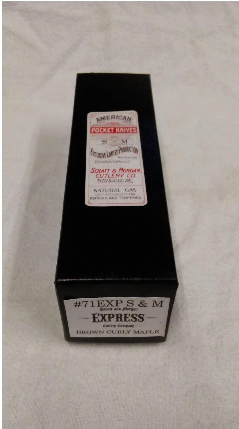
Figure 7. Black Box used in earliest releases of Express John Henry Knives, showing end label with handle material.