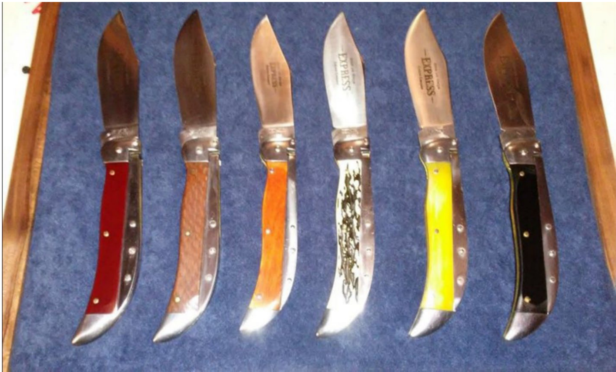
Figure 3. Numbers 1-6, John Henry Express Knives

The following three figures, with associated small Excel files, show all 18 John Henry knives that we know were completed in the Queen factory.