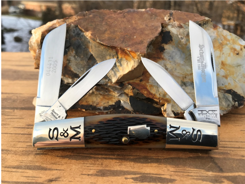
#32, 4-blade Congress in Pearl with signature bolsters. Clarence Risner, SFO, 2005, 1-100.