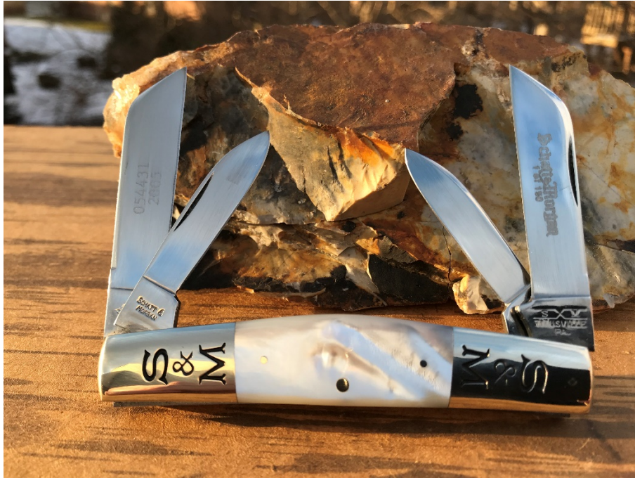
#32 4-blade Congress in Pearl with signature bolsters. Clarence Risner, SFO, 2005, 1-100.