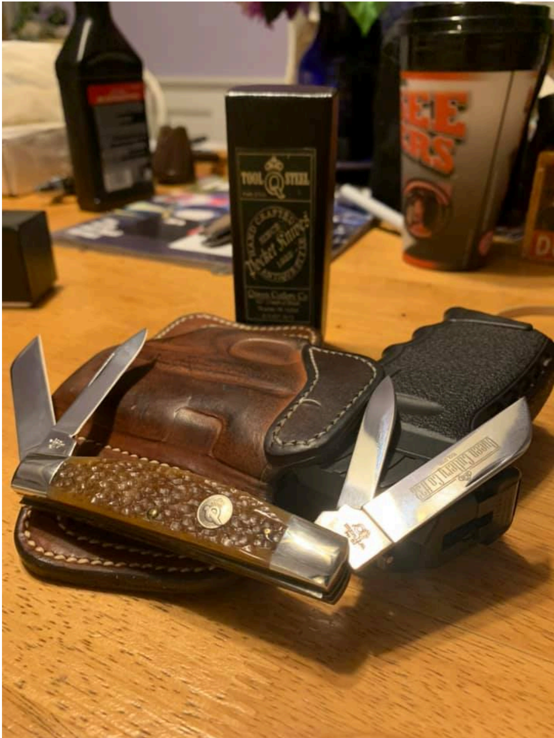
#32, Large Four blade Congress in Peachseed bone. Note tool steel box, tang stamp and blade etch consistently show D2 steel