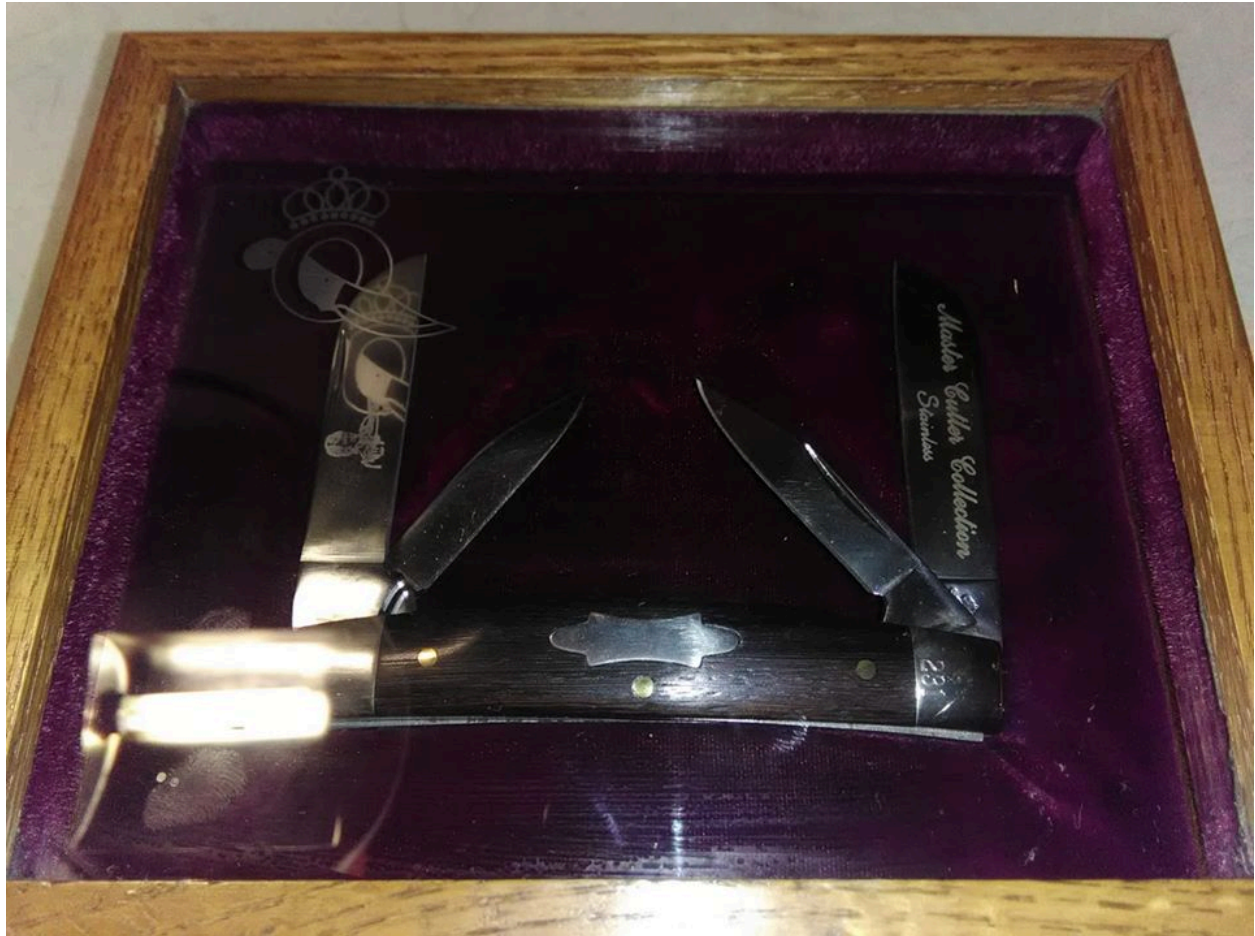
#32 Large 4-blade Congress in Walnut in Oak box with "Master Carver" etch, for Queen 66 th Anniversary, Stainless steel, serialized on bolster