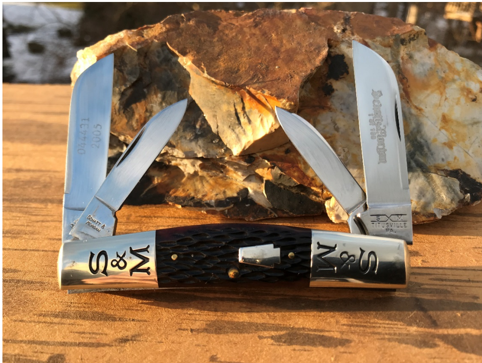
#32, 4-blade Congress in Jiggled brown bone with signature bolsters. Clarence Risner, SFO, 2005, 1-100.