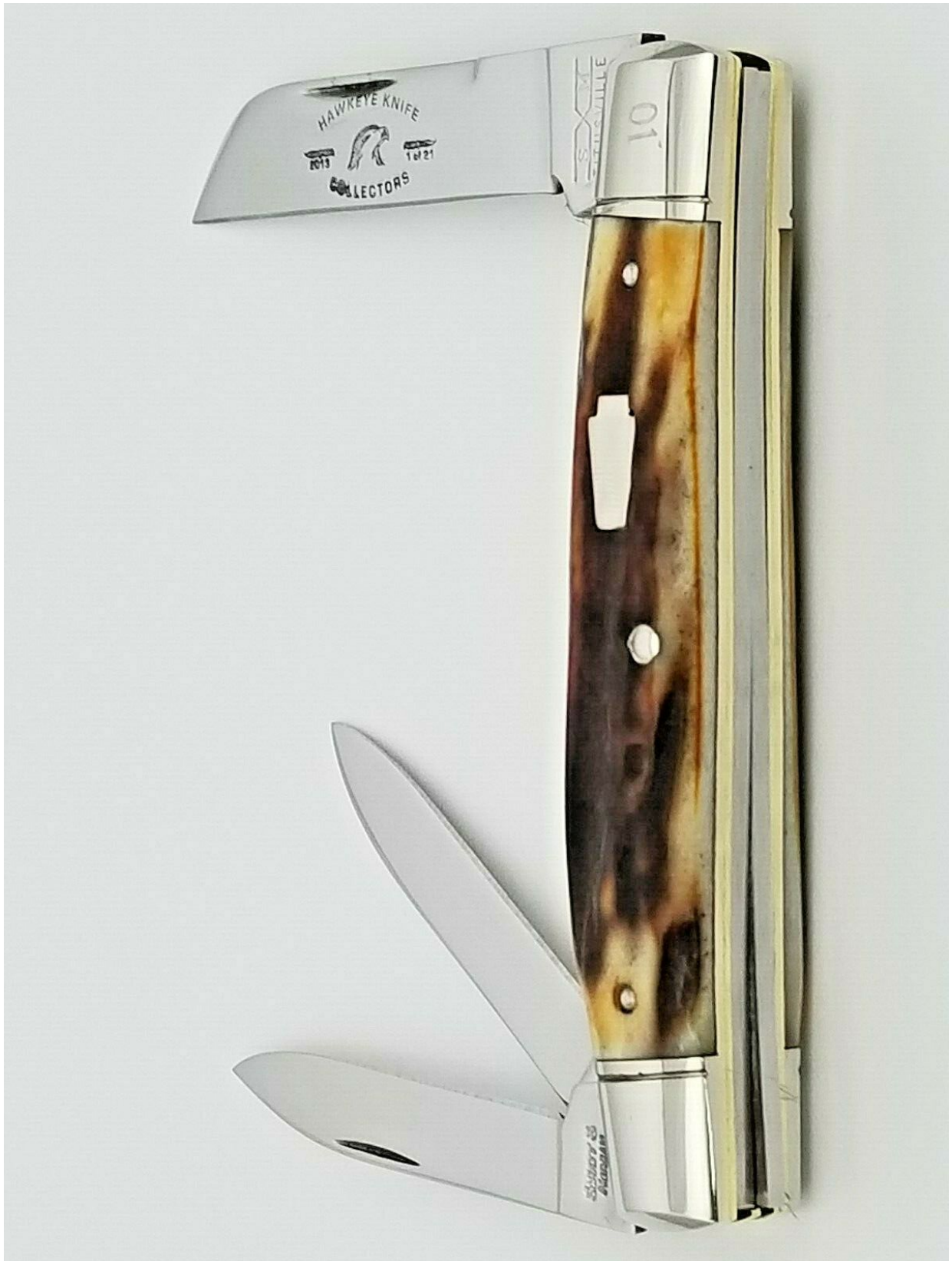
#32 Large Congress Stag whittler, with sheep's foot main blade, 2013, 1-21, serialized on bolter.