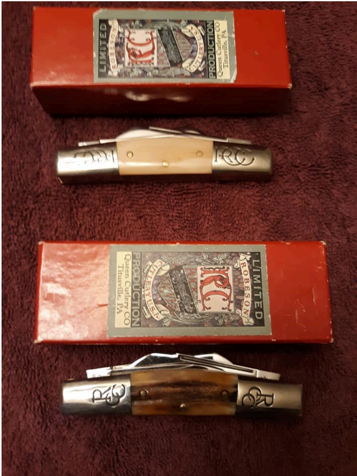
#32 Large 4-blade Robeson Congress, Top in smooth White Bone, Bottom, in Mammoth tusk, both 1-100, about 2014