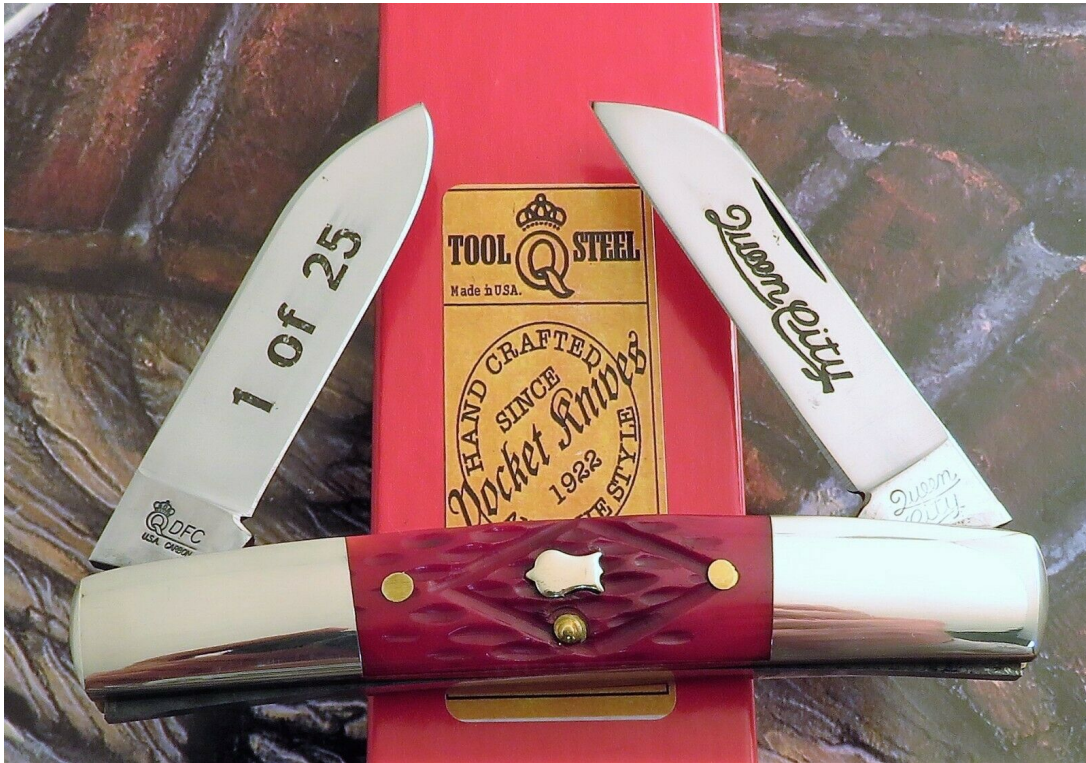
#31, Large 2-blade Congress, Queen City, Red jigsaw bone diamond, Carbon steel, small heraldic shield, 1-25 (Note box, for "tool steel" does not match tang stamp.)