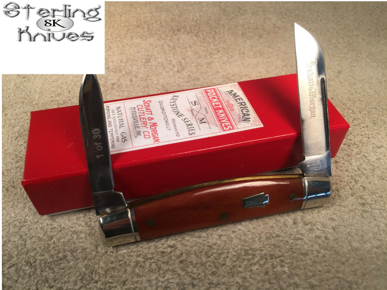
#31, Schatt & Morgan 2-blade large Congress in smooth brown bone. With sheepfoot main blade. 1-30, about 2016.