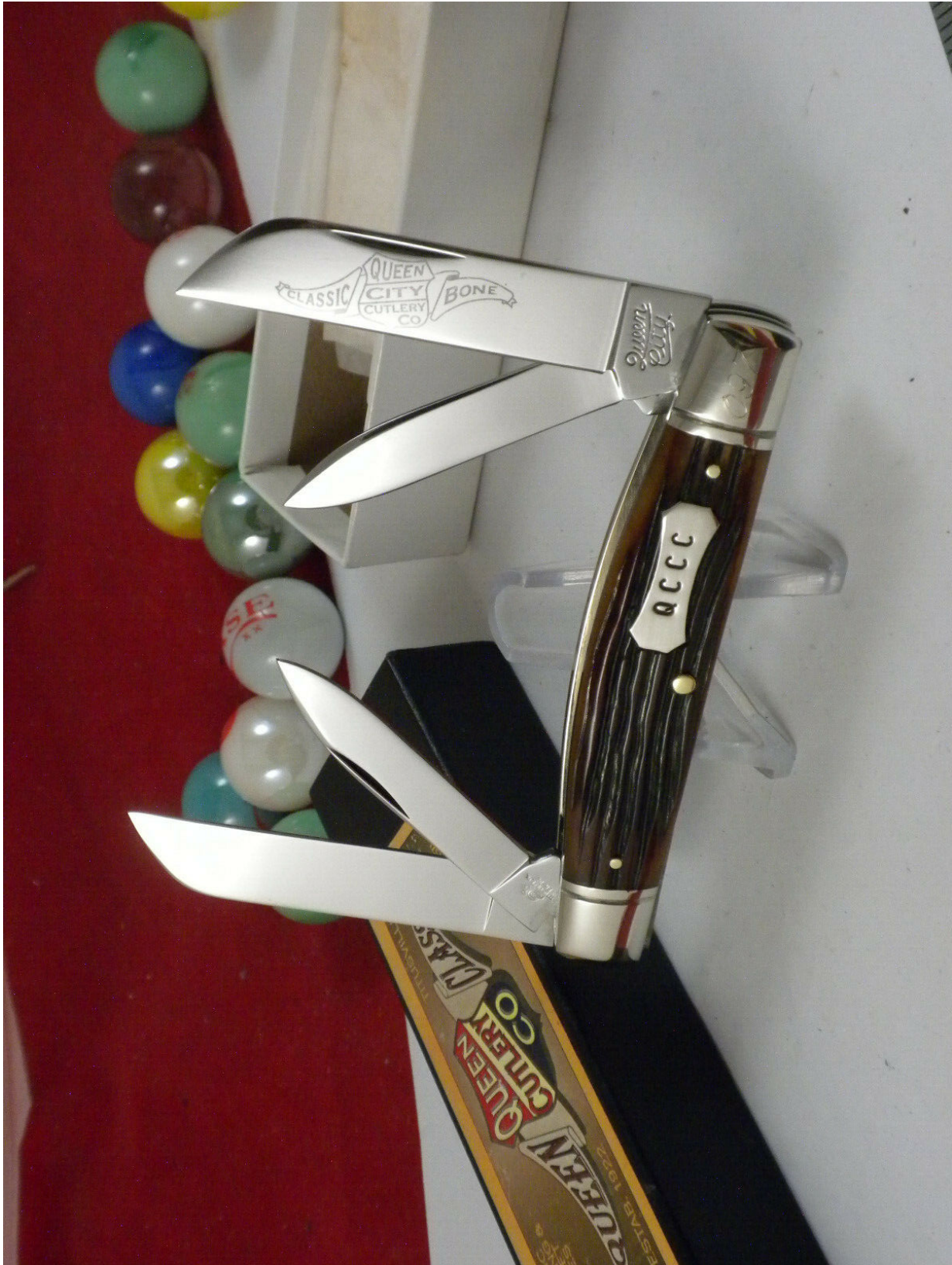
#32. Queen City Classic, 4-blade Congress Brown winterbottom Bone. Note correct box and master blade etch on this knife. About 2002, with D2 steel.