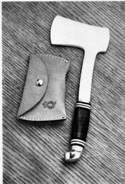
SBA80 — Single bit 11½ ounce Archer's Axe. Finest quality steel. Chromium plated. Solid one-piece construction—8-inch handle. Complete with leather sheath, saddle stitched. Slot in sheath for carrying on the belt.