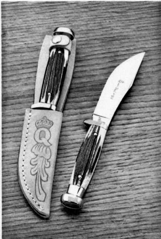
No. 98 Skinning Knife — Genuine Frontier bone stag handle with 4 inch scimitar shaped flat blade. Made of Queen Steel. Will not rust or stain and because of our secret tempering process, will stay sharp far longer than other knives. Complete in leather sheath made of top grain cowhide, saddle stitched with handsomely embossed design. Sportsman's favorite.