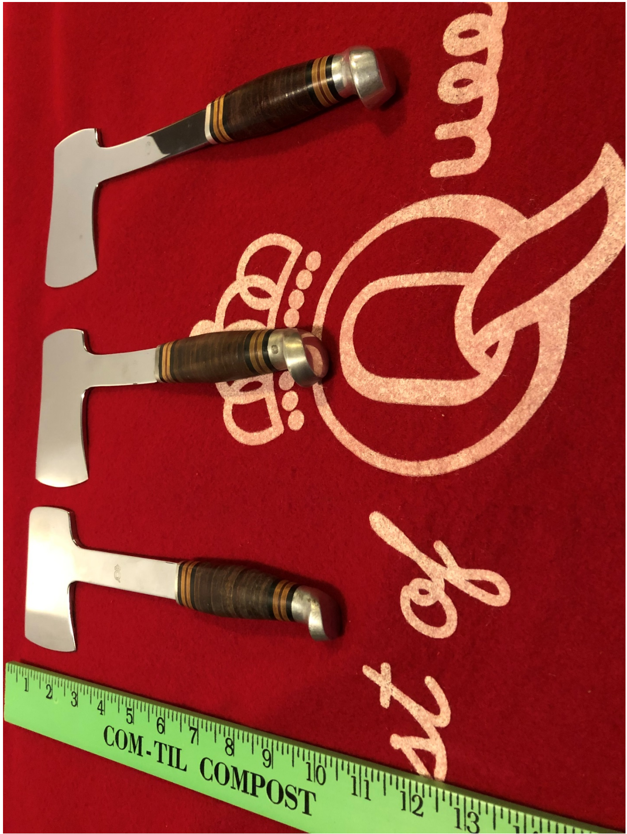
Figure 2. Three variations of Archer's Axe, with overall length, edge width, and pommel variations